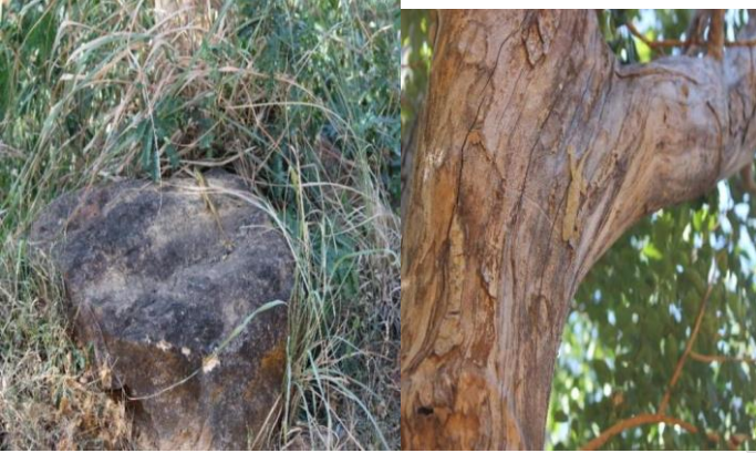
Eutropiscarinata Hemidactylus leschenaultii