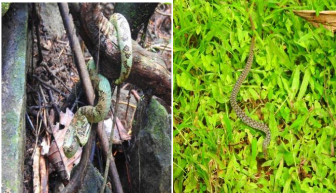
Craspedocephalus malabaricus Amphiesmastolatium