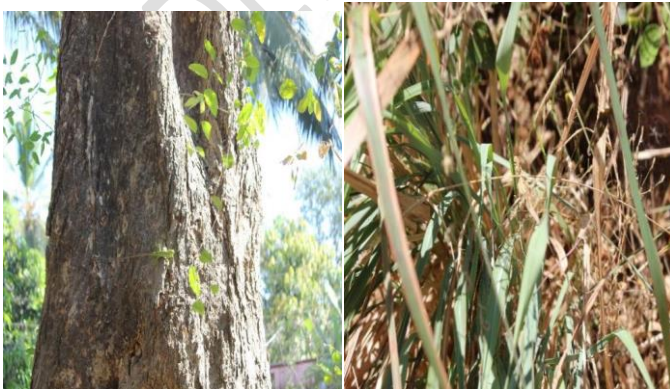
Calotes calotes Sitanavisiri