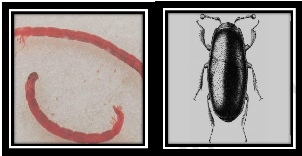
Fig 5. Chironomidae(red pale)_ Diptera. Fig 6. Sphaeridae(Bivalve).