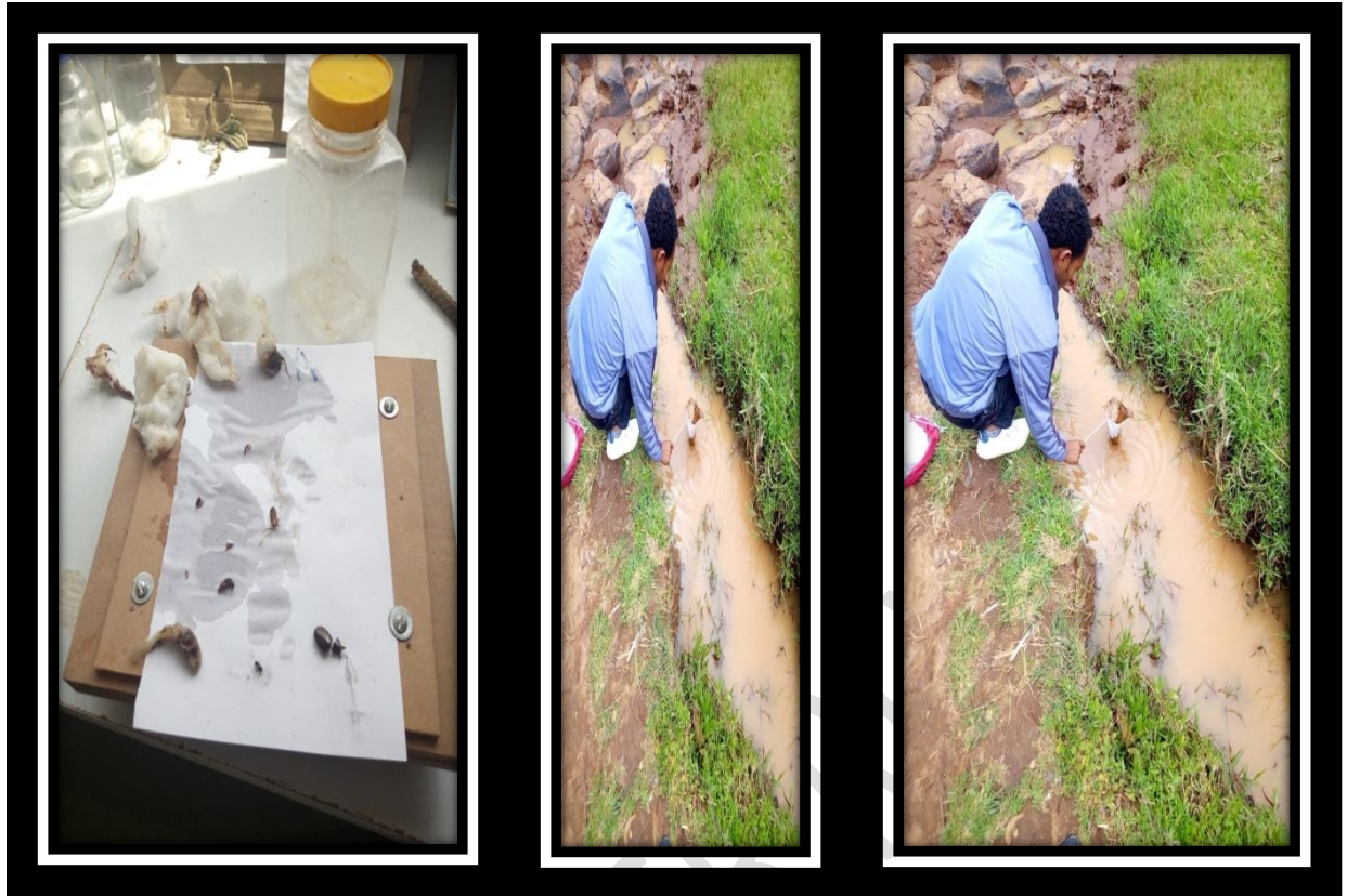
Figure 2. Photos during collection of benthic macro invertebrates