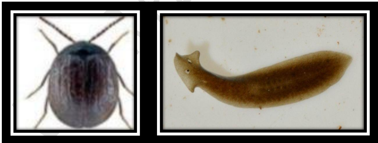
Fig 6.Psephenidae(Coleoptera) Fig 7. Turbilaria