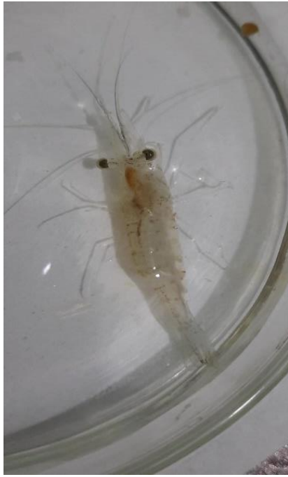
Fig 1 : Freshwater prawn, M. lamarrei

The total length of each individual was measured with the help of divider, meter scale and vernier caliper and weight by digital weighing machine [ 33, 5, 24, 28, 23] . The male and female prawns were analyzed separately by collecting them according to their gender and by the month for body mass and length-weight relationship [10] .