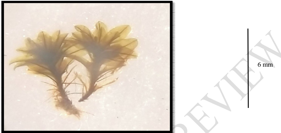
Figure 1: Photomicrograph of Hyophilasp. under dissection microscope

sample. The animals were also enumerated and the relative percentage of different groups of these microscopic organisms were calculated. In addition, the different groups of invertebrate microfauna were compared between wet and dry season.