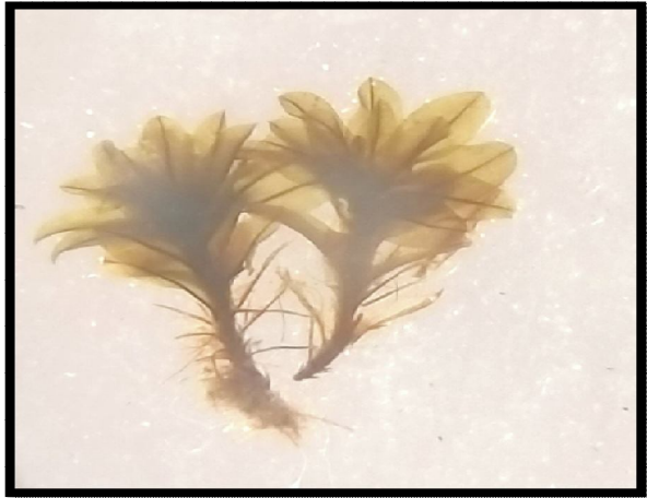
Figure 1 : Photomicrograph of Hyophilasp. under dissection microscope

these microscopic organisms were calculated. In addition, the different groups of invertebrate microfauna were compared between wet and dry season.