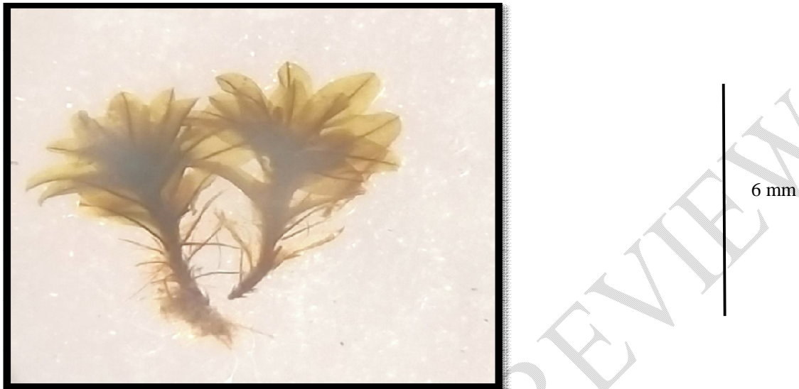
Figure 1 : Photomicrograph of Hyophila sp. under dissection microscope

sample. The animals were also enumerated and the relative percentage of different groups of these microscopic organisms were calculated. In addition, the different groups of invertebrate microfauna were compared between wet and dry season.