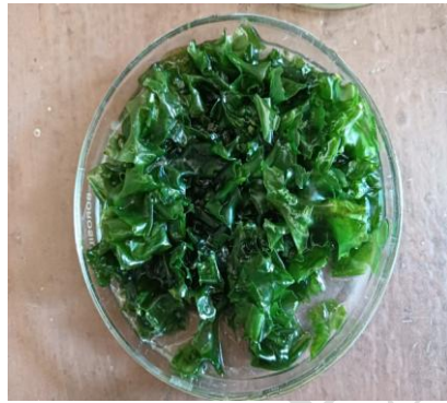
Fig:1- Fresh washed Ulva fasciata algal sample

The samples are collected from tenneti beach Visakhapatnam. Two types of algal samples were collected in the month of May during summer season aseptically by using gloves and fore-capes in to clean and grease free bottles. The algal sample analyzed at the spot by using google lens to identify the genes. Collected samples were carried to the microbiology lab, St. Ann's college for women. (Fig:1)