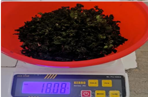
Fig:4- Ulva fasciata