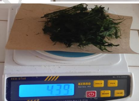
Fig:5- Chaetomorpha antennina