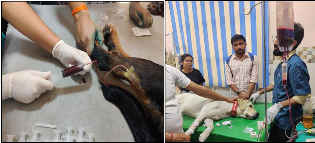
Figure 4: Blood transfusion

compatible, as demonstrated by major and minor cross-matching. The recipient dog received 300 milliliters of blood over three hours. No adverse transfusion reaction was seen.