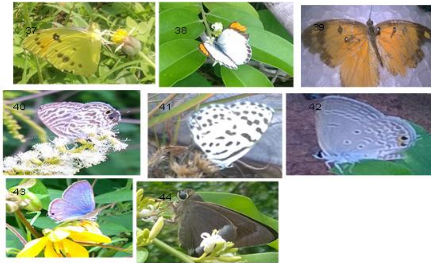
Figure 1: Butterfly species seasonal abundance recorded in study area 1) Graphiumnomius spp., 2) Papilio demoleus , .....